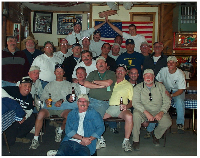
This not-so-secret society gets together annually—living the gospel that was written some thirty years prior! A society steeped in tradition and culminating with secret hand shakes and shit like that!

And our teachings are simple, justified, and proven: