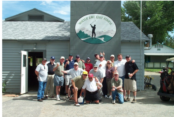
A post-tournament celebration photo including the GM for Walker Lake Golf Course.....after the 12th Annual Rhino's WIDE OPEN!

We raised $160 for the Fishin' Mission Foundation!