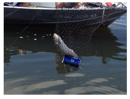
Started getting organized for the Saturday Dinner in Camp, but Sparky had to take a nap first. Tommy Boy was over on Sandy Beach and grabbed a nice 3 lb 8 oz 'bow.