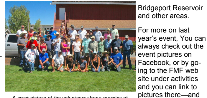
A great picture of the volunteers after a morning of picking up trash and a great BBQ lunch!