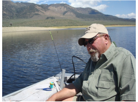
He seemed to create stories just by being there! Any mention of a minibike, still stirs stories around the campfire.